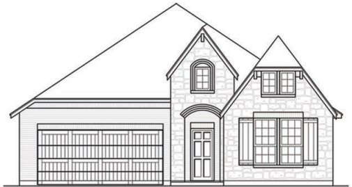
JACKSON - ELEVATION C