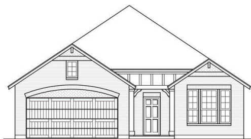
GIBSON - ELEVATION A