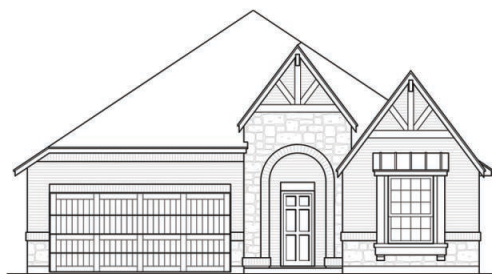
GIBSON - ELEVATION C